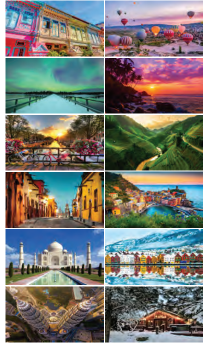
IMAGES OF THE WORLD